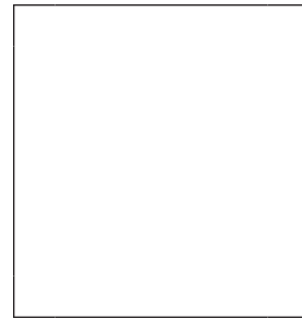
Right index fingerprint of alien removed

_____ (Signature of alien being fingerprinted)